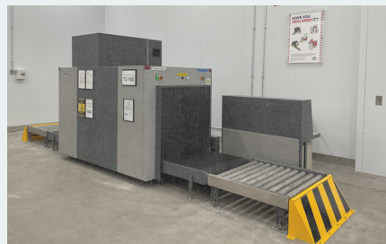
X-ray Cargo Screening in Temperature-Controlled Zone