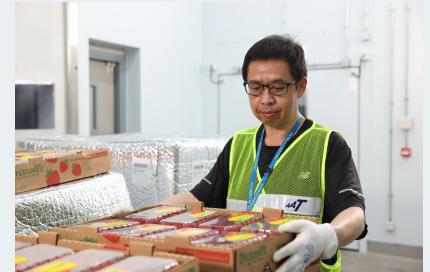
Temperature-Controlled Cargo Build-up/Breakdown Area