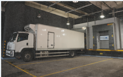
Prioritized Truck Docks with Dock Shelter